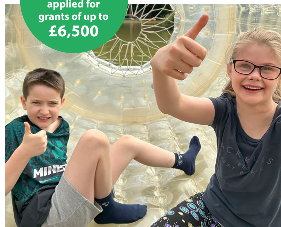
BOSP received Brentwood Community Fund support for their Forest Fun Days.

This year, 21 not-for-profit organisations applied for grants of up to £6,500